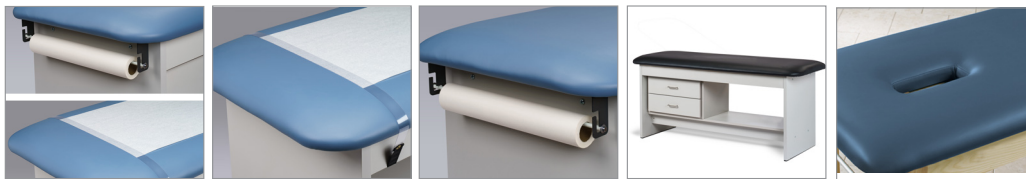
034- Paper Dispenser & Cutter Combo