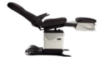
Seated Exam Position