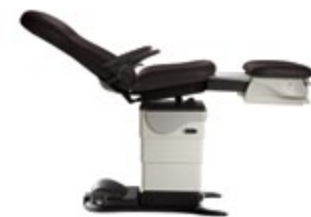
Standing Exam Position