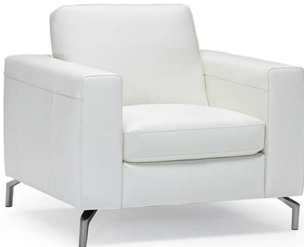
■ Vers. 233