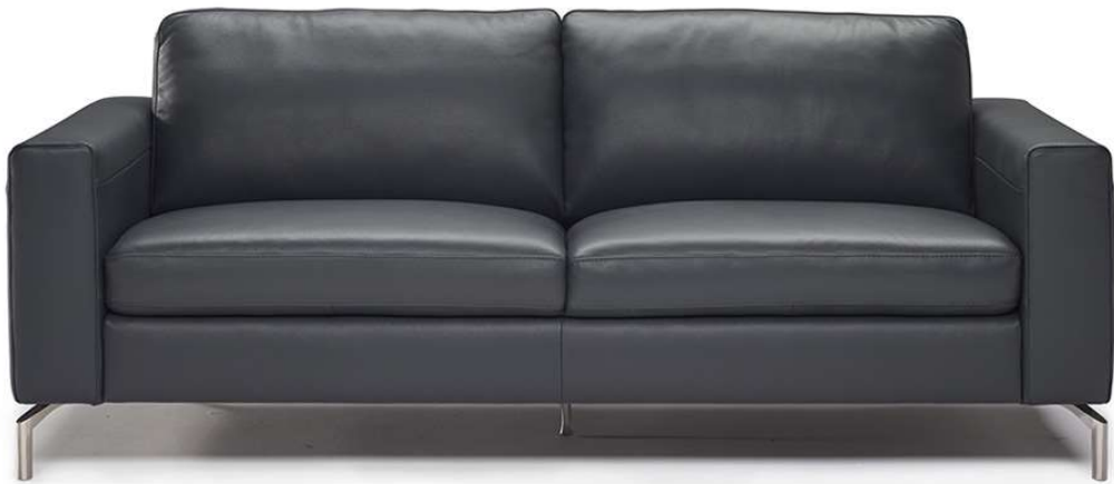
■ Vers. 239