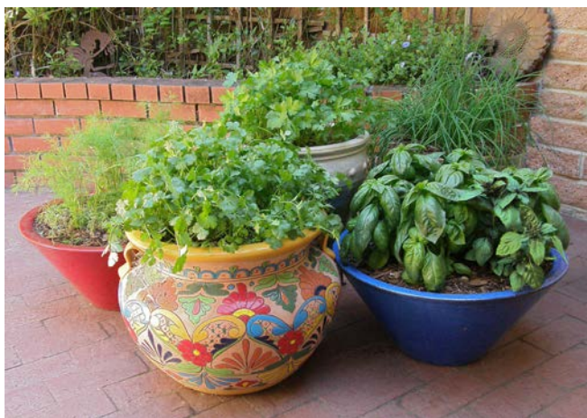
Let herbs develop flowers. Basil, oregano, thyme, and other herbs are pollinator magnets.