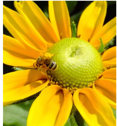
A tiny bee carries a lot of pollen!