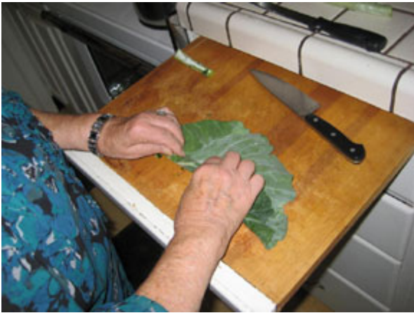
Click Here to view