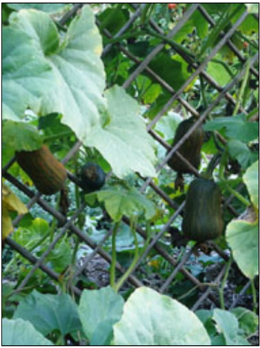
"Honey Nut" butternut squash

harvest the climbing, miniature ‘Honey Nut’ butternut squash, whose abundant fruits that are just 6 inches long and perfect for 1-2 servings each. The vines are very disease resistant and make a handsome landscape feature.