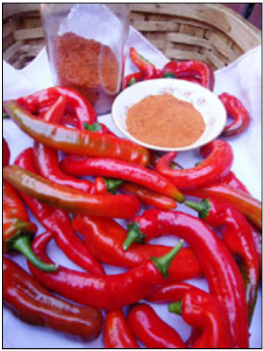
"NuMex Las Cruces" Peppers

harvest the climbing, miniature ‘Honey Nut’ butternut squash, whose abundant fruits that are just 6 inches long and perfect for 1-2 servings each. The vines are very disease resistant and make a handsome landscape feature.