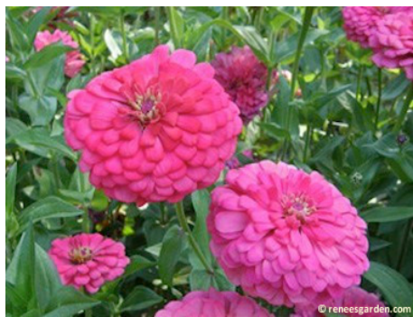
"Raspberry Sorbet" Zinnia

Brand new unique wild arugula leaves have an incredibly delicious and spicy flavor exactly like freshly made wasabi paste. Easy to grow with pretty edible flowers. More weather tolerant than other arugulas.