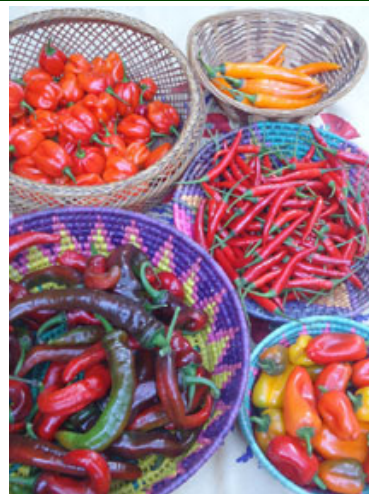
A final harvest of peppers and chilies