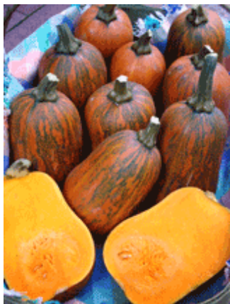
Honey Nut "personal size" squash

We are also using Pacific Gold Mustard. This cover crop has very high levels of glucosinolates which have a fumigating effect in the soil to help fend off soil dwelling pathogens that affect crops like tomatoes and basil. Pacific Gold Mustard also takes up large amounts of nutrients that would otherwise be leached out of the soil. In the spring, the mustard plants are either turned into the soil or composted and added back as top dressing. Then their stored nutrients are released into the soil and become available for spring crops to use.