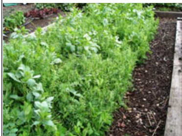
Fava bean & purple vetch cover crop adds nutrients