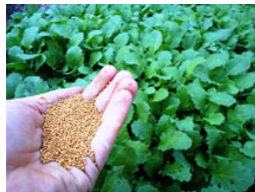
Pacific Gold Mustard cover crop actually fights soil borne diseases