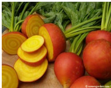
"Gourmet Golden" Heirloom Beets