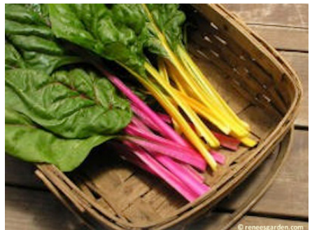
"Neon Glow" Chard