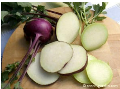
"Crispy Colors Duo" Kohlrabi"

To take advantage of this offer, use our special "Seeds on Sale" Order Form Order now while supplies last!