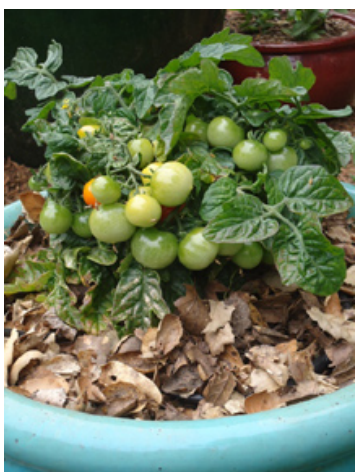
Bonsai Container Tomato

Another great container variety this season is our mini spaghetti squash trial. We have found a variety that grows nicely in a container, setting several pretty per plant, and appears to be quite early to harvest. If it tastes as good as it looks, then we will call this variety a winner and offer it in the future.