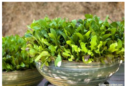
Cut and Come Again Mesclun Lettuce

Mid to late summer months are a perfect for sowing seeds of short season varieties which tolerate cooler nights and shorter days and provide tasty fall harvests. We call this "Second Season Gardening". Read this month's feature article Gardening for a Second Season for planting information to extend your garden's production this year. For fall planting suggestions, also refer to our Kitchen Garden Plans for both short and long season areas.