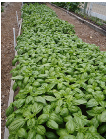
"Perfuma Di Genova" Basil comparison trial - Renee's variety in front