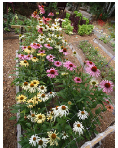
Cone Flower Mix

This is the 2nd season that we have been evaluating a brand-new Echinacea (a.k.a. Cone Flower) mix that features all the new colors that have recently been developed in these beloved summer flowers. This variety is easy to grow and even begins flowering the first season from seed. Then in their second season, the plants get very full with lush basal leaves, and burst into bloom in