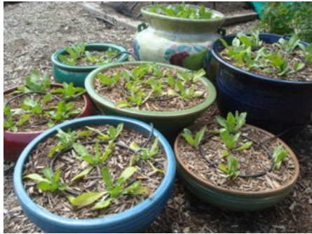
Calendula starts in pots

We are also trialing several heirloom varieties of Red and Green Borecole Kale. These frilly, nutrient-rich leaves will be a wonderful addition to soups and pasta dishes, or just steamed with a little olive oil and lemon juice.