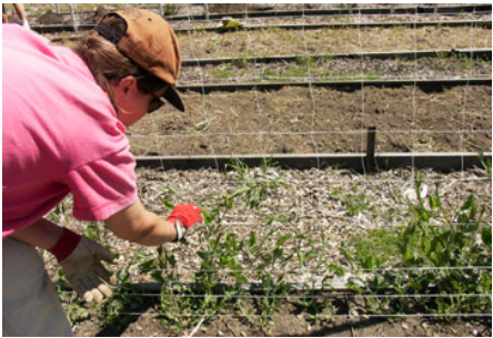
Training Sweet Peas on netting

Cool season flowers like Sweet Peas , Godetia, and Calendula are starting to grow vigorously now that night time temperatures have started warming up a towards 50°F. By the end of May, we will be seeing them burst into bloom with their incredible colors. We are trialing several new Sweet Pea combinations and some single colors, a double Godetia, and several colors of a new Calendula bred especially for containers. These bright, fully double flowers will grow to just 10-12 inches tall; perfect to shine in containers on a patio with pretty edible petals to add to salads or rice dishes.