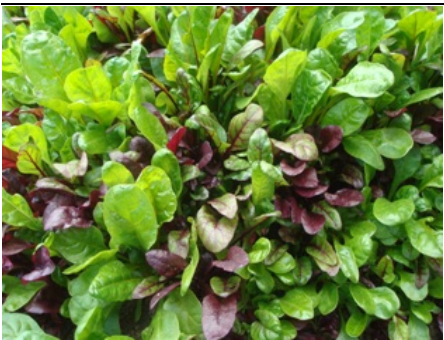
Braising Greens Mix

Varieties that grow best while the weather is cool are thriving now in our spring garden. One favorite is our new Braising Greens Mix, a colorful blend of 4 varieties: 2 colored chard varieties and two beets grown here for their different colored greens. (This Braising Greens Mix will be one of our new introductions for 2012). The fast-growing blend is sown thickly in a garden bed or container. Baby seedlings can be harvested very young as tender micro-greens, or grown larger to shear off with a scissors at 4-5 inches for meltingly tender braising or stir fry greens - really healthy and delicious eating at either stage.