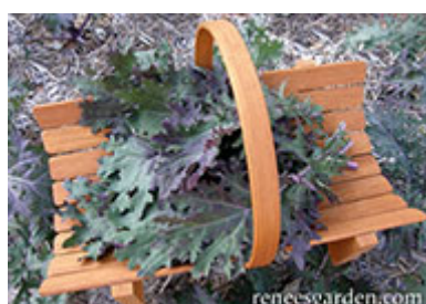
Wild Garden Frills Kale