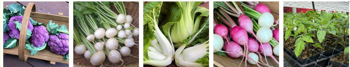
Purple Crush Cauliflower

Here in the California trial garden, nighttime temperatures have reached 50°F (10°C) at night, so we have moved our tomato starts outdoors to “harden off” a.k.a. acclimating them to outdoor conditions. After 7 to 10 days of transition time, they'll be planted in the garden and we can start dreaming of summer tomatoes!