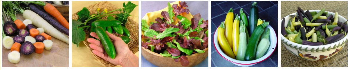
Tricolor Carrots Circus Circus

There's still plenty of time to plant vegetables and flowers for bountiful spring and summer harvests – and to give you a little added incentive, we're putting our most popular varieties on sale! Our customers return to these tried-and-true selections again and again for their flavor, beauty and productivity. We know you'll love them, too!