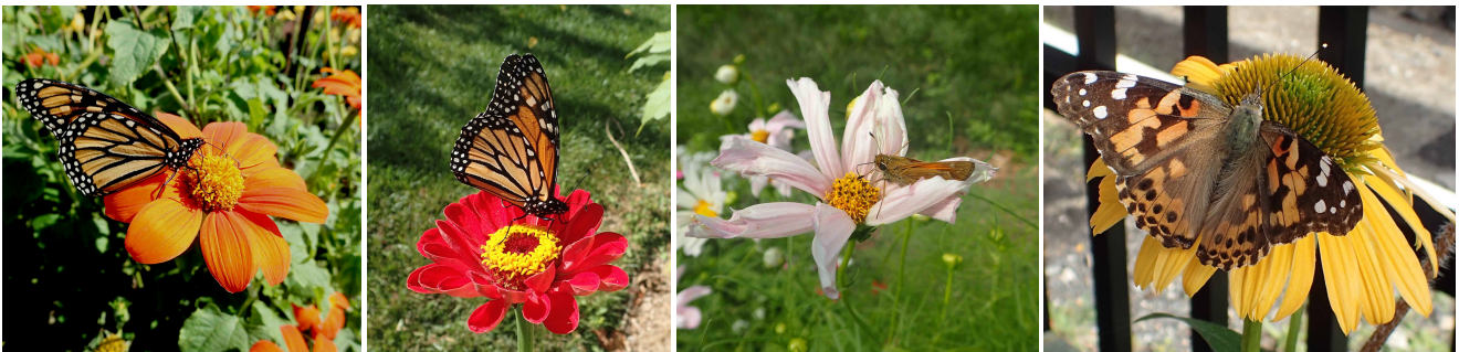
Tithonia, Zinnia, Cosmos, Rudbeckia, Coneflower, and other daisy-like flowers have easy landing platforms for butterflies. They're long blooming and colorful, and easy to grow from seed.

Plants with large, flat petals make it easy for large butterflies to land.