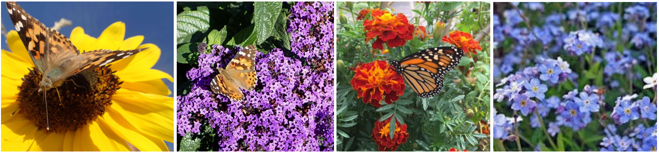
Sunflower, Heliotrope, French Marigolds, and Forget-me-nots have multiple florets, with nectar easily accessible to butterflies.

Plants with multiple florets contain copious amounts of nectar.