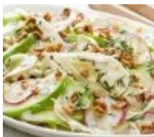
Recipe Of The Month Crispy Radish, Fennel And Apple Salad

Tart, crunchy radishes and fennel are a fine contrast to