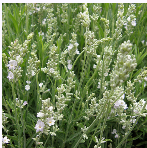
Container Lavender White Ice