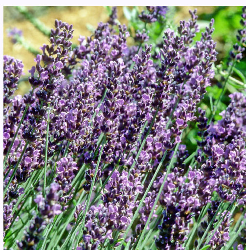
English Lavender Hidcote