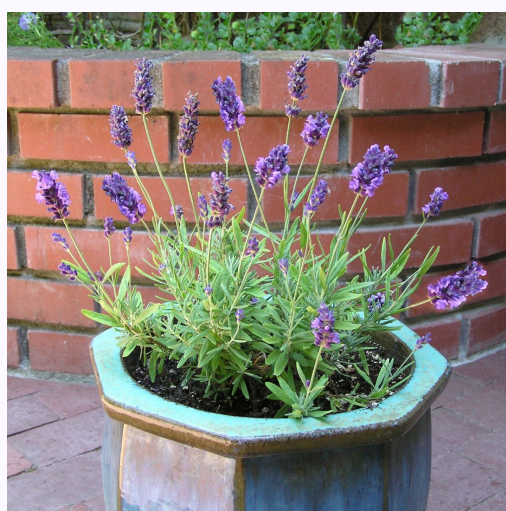
Container Lavender French Perfume

All lavenders are magnets for honey bees, native bees, beneficial insects and butterflies of all types.