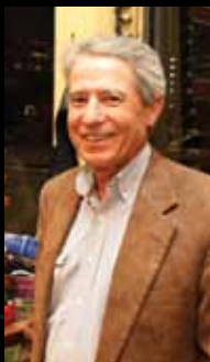
CHACON BELTS & BUCKLES

His works are part of the: Museum of New Mexico, Wheelwright Museum Collections and Photo archives of the Smithsonian Institution.