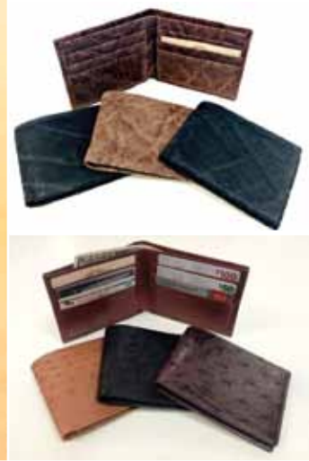
Top Row: Genuine Alligator, Elephant and Ostrich Bi-fold Wallets. Second Row: South Texas Saddlery Soft Leather Bird Bags, Hand crafted leather notepad, hand carved initials included Third Row: Hand crafted cow hide Christmas stockings, (up to 7 hand carved letters included.) Genuine Full Quill Ostrich Briefcase.