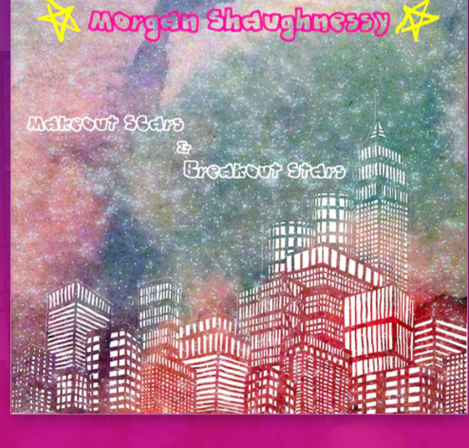
Makeout Scars & Breakout Stars