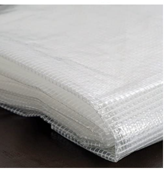
HydraTarp Heavy Duty - Reversible Clear