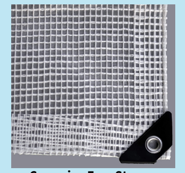
Corrosive Free Strong Grommets Spaced Every 18"

We heat seal a thick nylon rope along all the edges or our tarps. This minimizes tarp shearing and tearing as the material wears and adds significant overall strength to the covering.