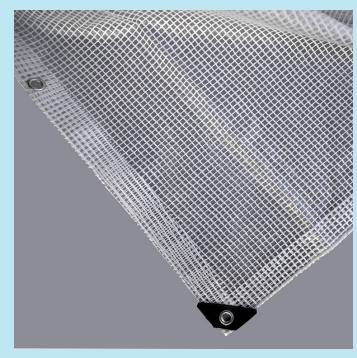
Reinforced Nylon Corners

Double reinforced corners with rope hem along all four edges. UV Protection Layer for added protection of assets and longer