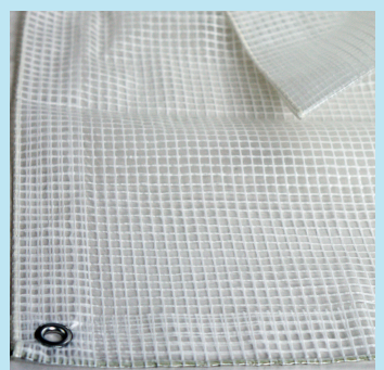
Waterproof and Reversible

HydraTarps have hardened grommets spaced at 18" intervals (instead of 24" spacing), the additional grommets provide additional tie down options and spread the stress over a greater area allowing less stress per grommet.