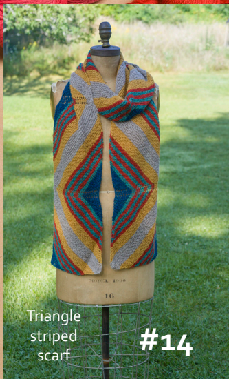
Triangle striped scarf #14

Single colorways of Superfine 400 are available in 100 gram, 400 yard twisted hanks (shown here); available in 30 colors.