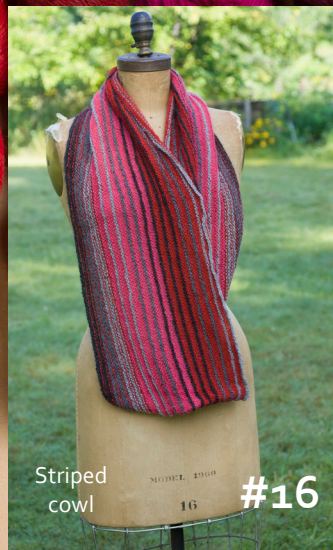
Striped cowl #16