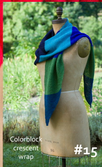
Colorblock crescent wrap #15