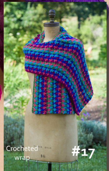
Crocheted wrap #17

Four new designs specifically for braid multi-packs are pictured above. Get these and all FREE pattern downloads for Superfine 400 at www.yarnandsoul.com