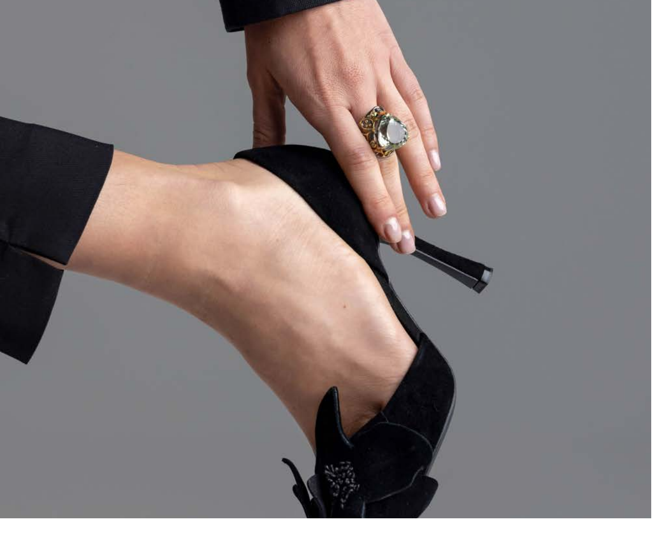
Josephine' Ring Green Amethyst & Peridot, 18K Gold & Black Rhodium $800.00