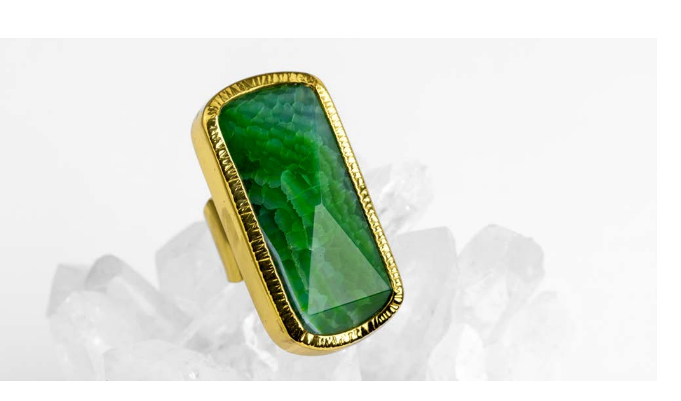
'Eve' Ring Polished Brass, Green Onyx $330.00