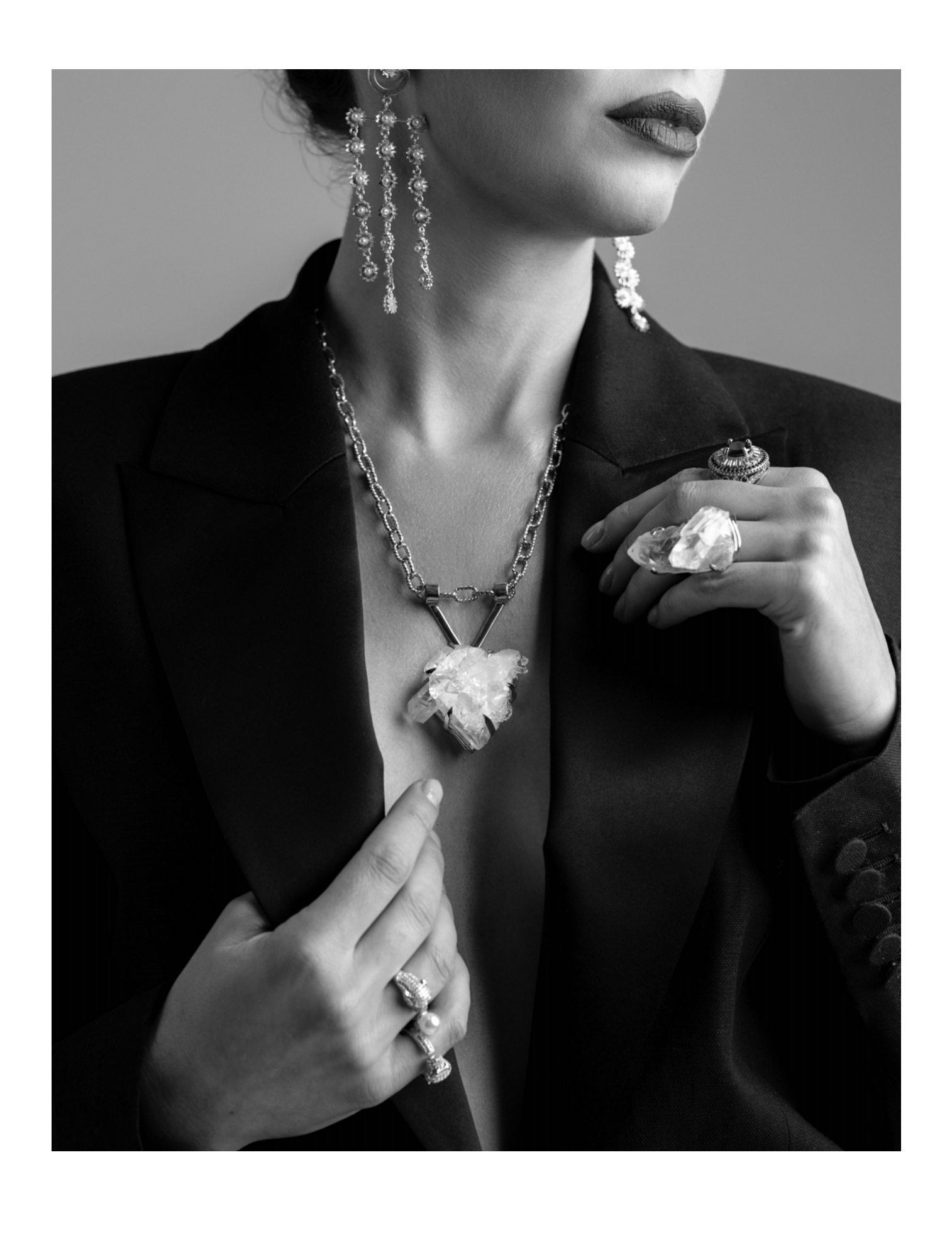
Midnight in Monaco