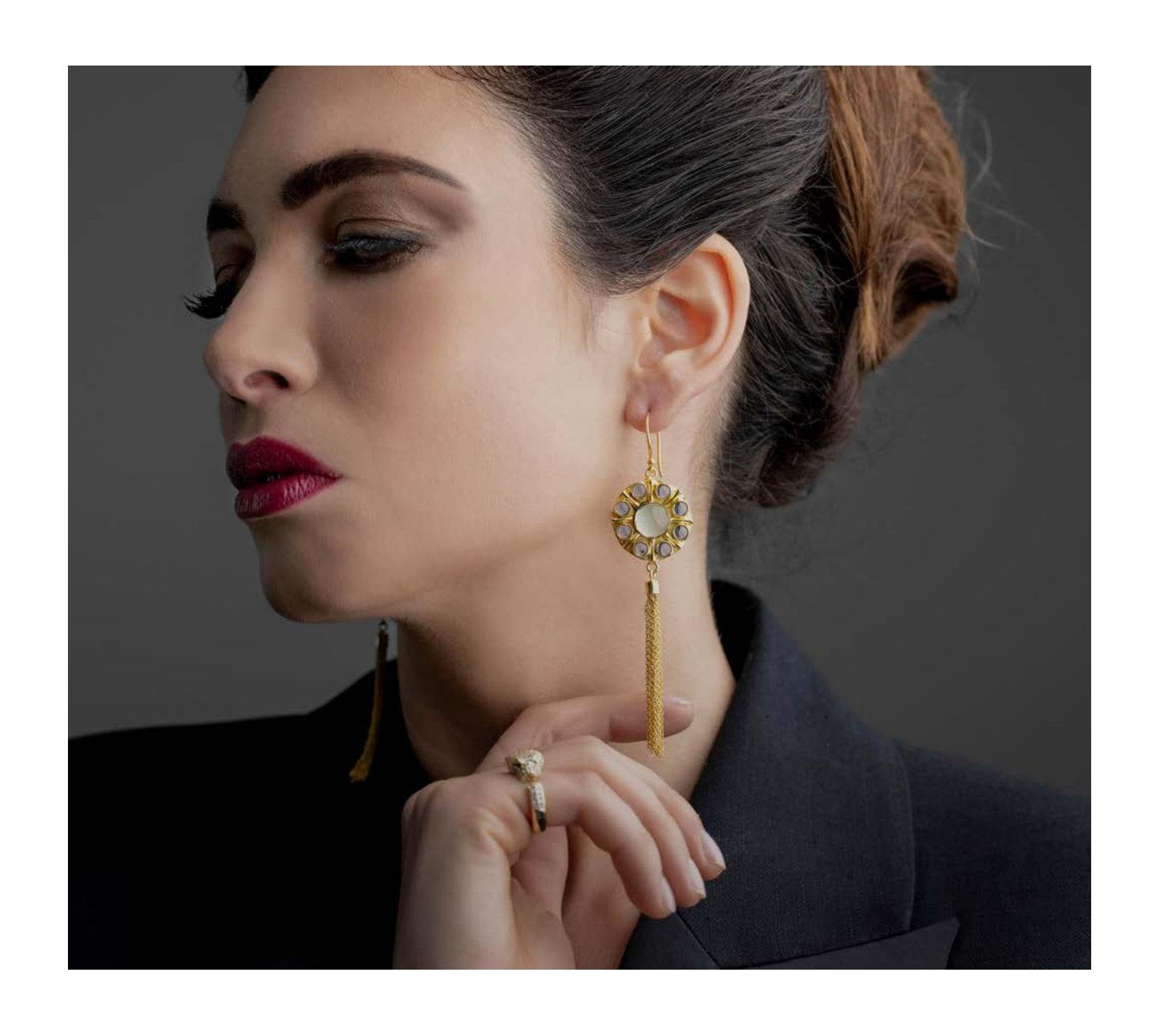
'Gabrielle' Earring 14K Gold plated London Blue Topaz & Blue Aqua Chalcedony $200.00