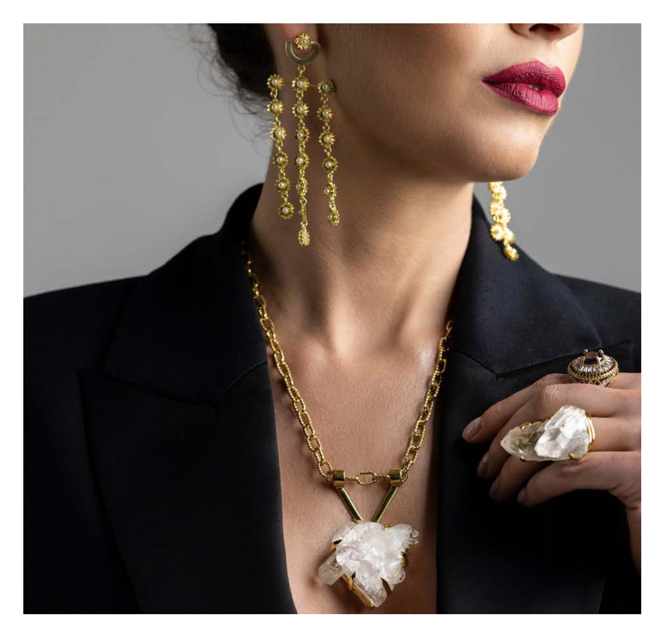
'Victoria' Earring 14K Gold plated, Freshwater Pearls $330.00