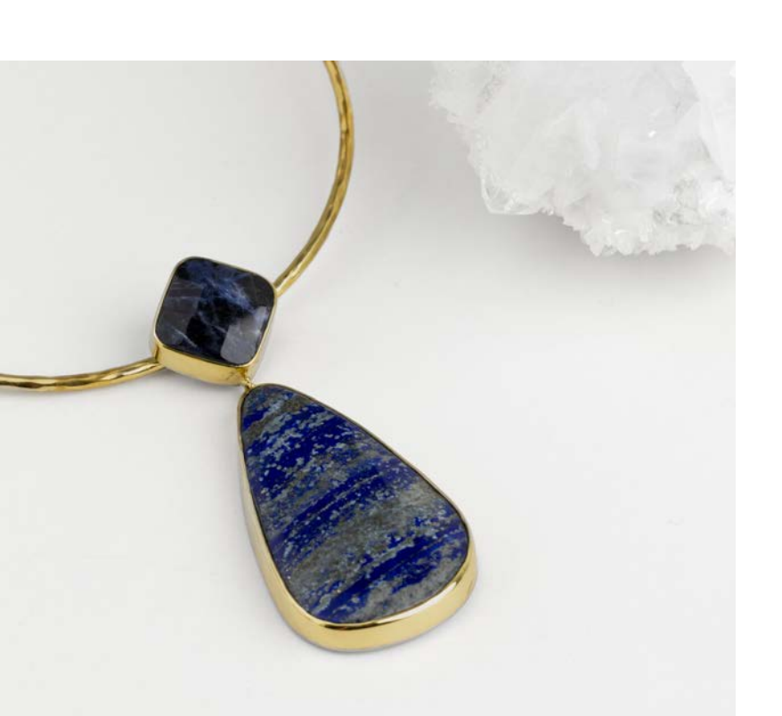
'Racquel' Necklace Polished Brass, Sodalite & Lapis Lazuli $390.00