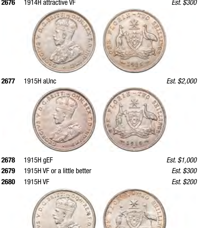
Est. $1,250 Est. $300