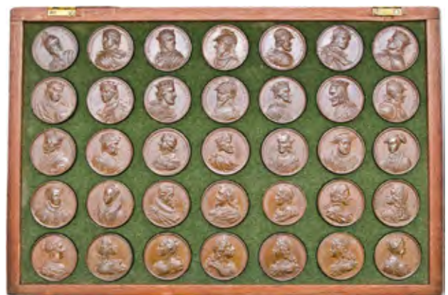
1368 Dassier's Kings and Queens of England c.1731 complete set of 35 bronze medallions incl George II Dedication and Queen Caroline medals, all housed in vintage custom-made cloth covered timber case (cracked on one hinge) for the complete set, all but the Cromwell medals 41mm, the latter 38mm. The collection generally VF-EF and rare complete. Viewing highly recommended (35 medallions) Est. $2,500