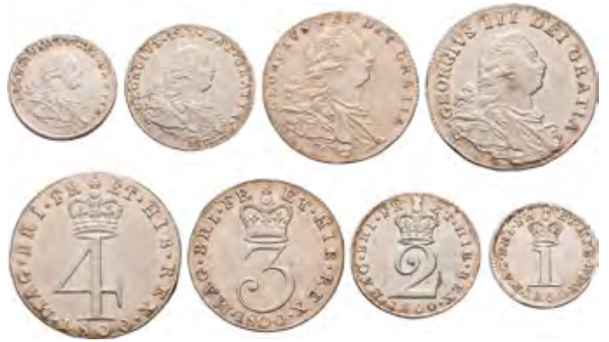
1364 George III 1800 set in 2x2s, EF-aUnc (4 coins) Est. $500