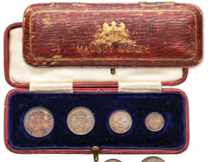
1365 Victoria 1888 set in original case for the issue. the coins toned gEF-Unc, the case with some damage Est. $250