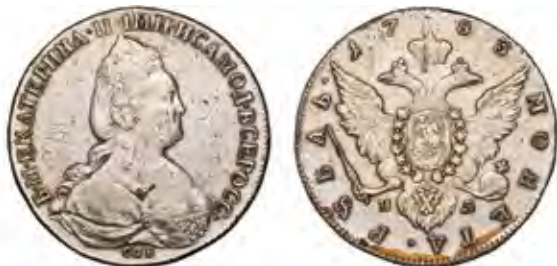
1272 Catherine II (1762-1796) Rouble 1783N3 (C6c) a few scratches both sides else Fine Est. $150