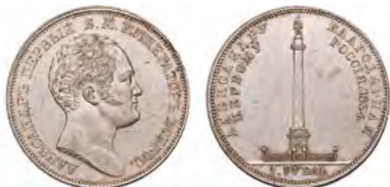
1275 Nicholas I (1825-1855) Rouble 1834 Alexander I Monument type (KM169) gEF or better Est. $1,250