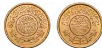
1283 Trade Guinea AH370 (KM36) choice Unc with prooflike fields Est. $600