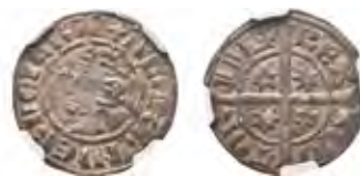
1286 Alexander III (1249-1286) second coinage 1280-1286 Penny (1.41gms) (S5056) in NGC holder graded AU 50, nice Est. $500