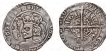
1288 Robert II (1371-90), Groat (3.90gms) Edinburgh (S5131) VF Est. $500