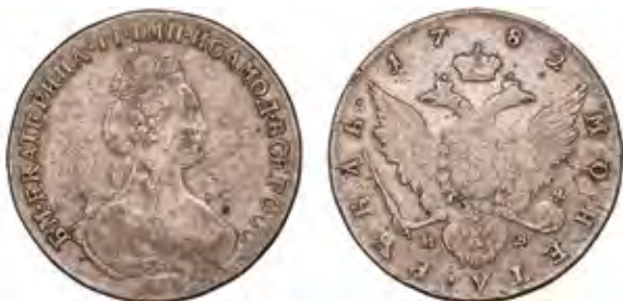
1271 Catherine II (1762-1796) Rouble 1782N3 (C6b) aFine Est. $125