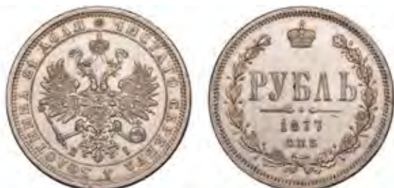
1277 Alexander II (1855-1881) Rouble 1877HI (Y25) EF, lovely obverse Est. $90