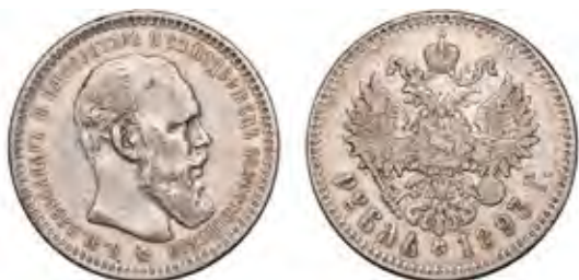
1278 Alexander III (1881-1894) Rouble 1893 (Y46) VF Est. $150