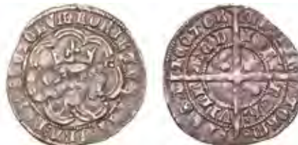
1289 Robert III (1390-1406), Groat (2.70gms) Edinburgh (S5164) slightly weak centres VF Est. $500