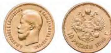
1281 Ten Roubles 1899 (Y64) gVF, the reverse better Est. $650