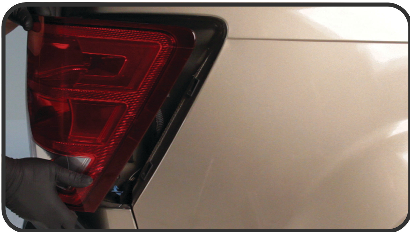
STEP 4: UNSEAT THE OLD TAIL LIGHT