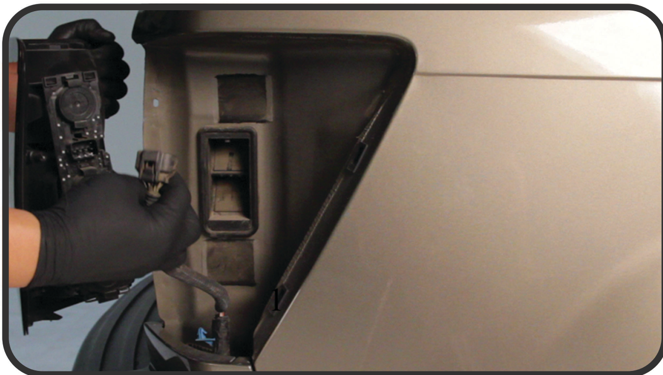
STEP 5: DISCONNECT THE TAIL LIGHT HARNESS