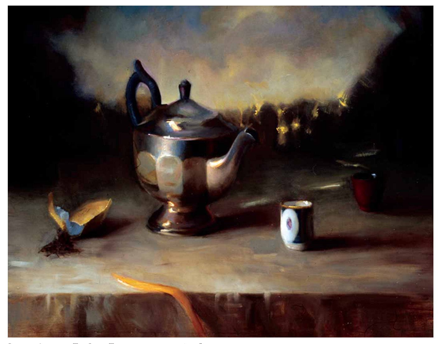
Juliette Aristides, The Silver Teapot, oil on panel, 16 x 22"