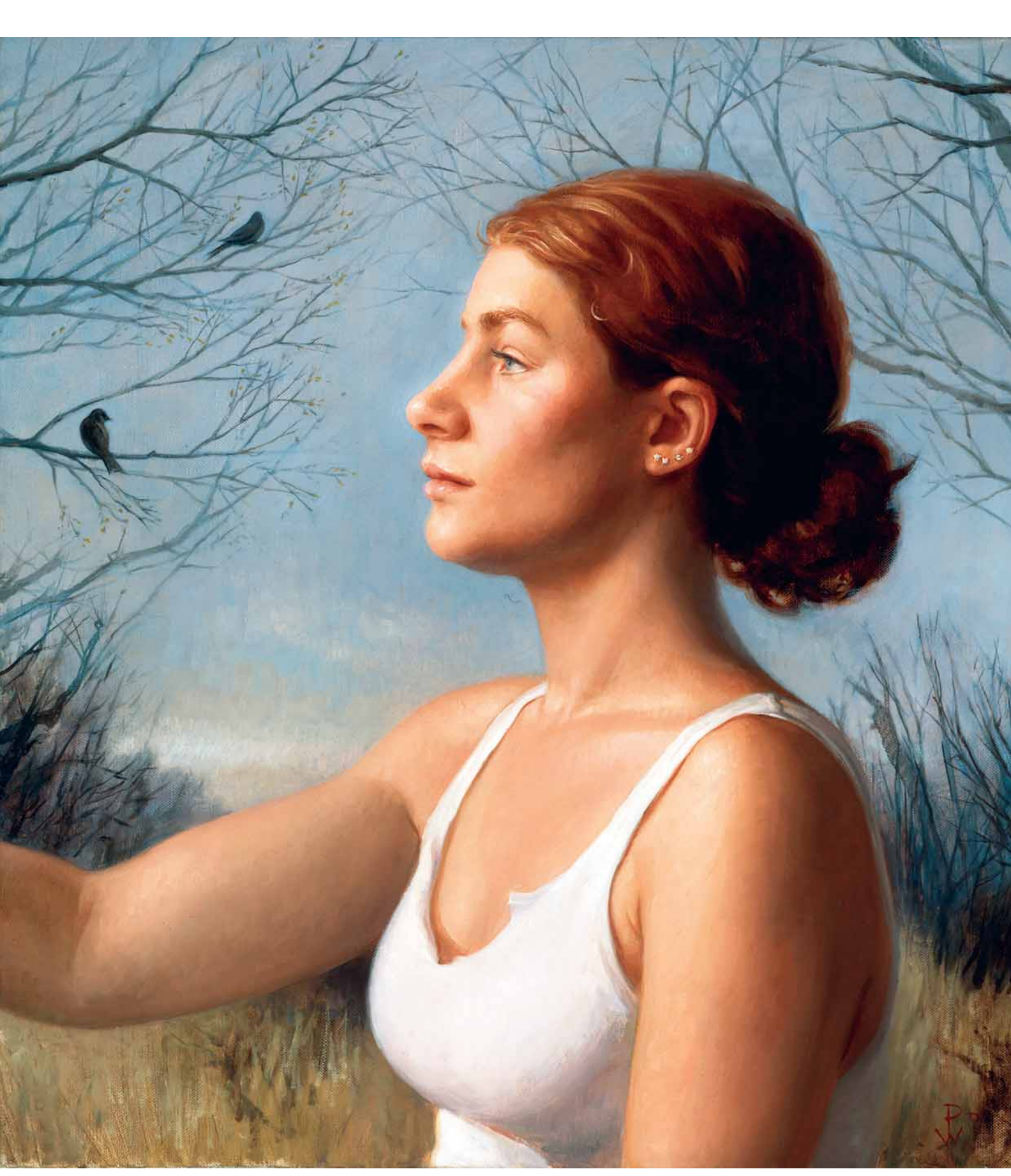
Patricia Watwood, Watching Birds, oil on canvas, 22 x 20"