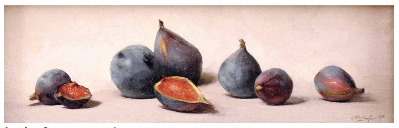
SARAH LAMB, FIGS, OIL ON LINEN, 5 X 15"

bring a bold, expressionistic feel to the subject, that cuts directly to the personality of the person she is painting at the time.