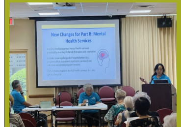
We learned the difference of Medicaid vs. Medicare from the Hawaii SHIP.