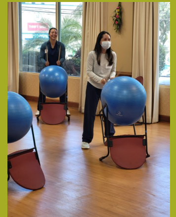
U.H. Geriatric Fellows visited and took a tour of our home and participated in our Taiko class.