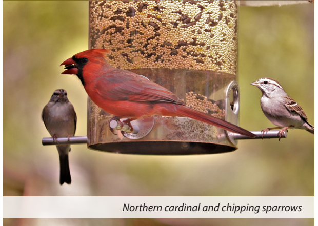
Northern cardinal and chipping sparrows

There are several different types of bird feeders, including suet feeders, house feeders, tube feeders, and hummingbird feeders, which will each attract different bird species.