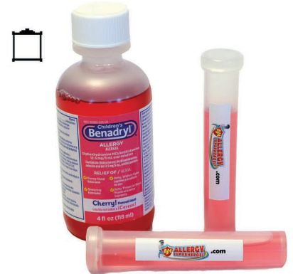
Single Dose Liquid Medicine Container