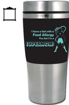
SuperMom Travel Mug