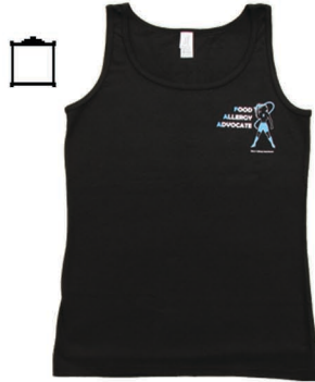
Food Allergy Advocate Tank Top