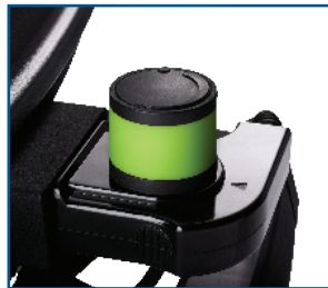
Continuous heat regulation