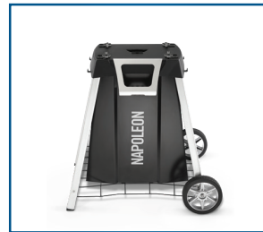
Optional stand with shelves available