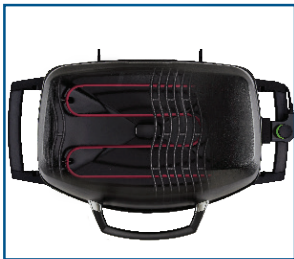
Heating coil with 2200 Watt