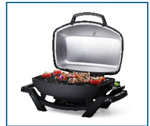
High lid for cooking larger joints of meat

*sizes and specifications of the finished product may differ in minor features