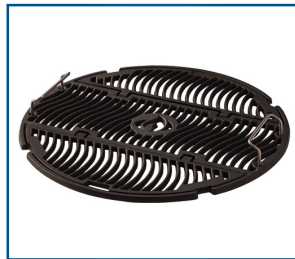
WAVE™ porcelain coated cast iron cooking grid (3-Height adjustable)