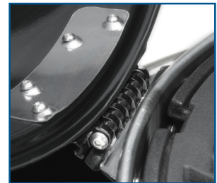
Corner hinged porcelain coated lid

*sizes and specifications of the finished product may differ in minor features