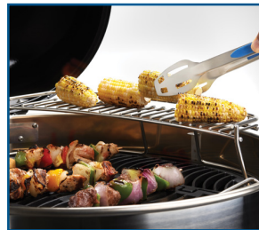
Warming rack optional