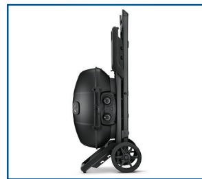
Folds and locks for easy storage