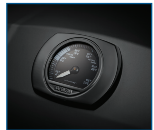
ACCU-PROBE™ temperature gauge with matt black finish

*sizes and specifications of the finished product may differ in minor features