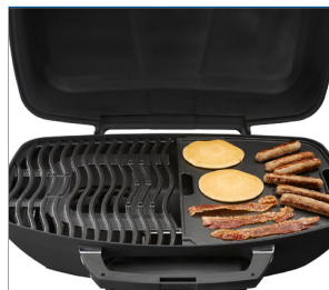
WAVE™ porcelain coated cast iron cooking grids (cast iron griddle optional)