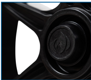
Large wheels with matt black finish