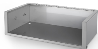
Zero Clearance Liner (BI-4223-ZCL)