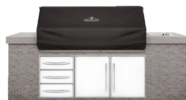
Premium Fitted Cover (61842)