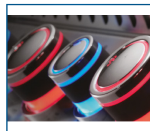
SAFETY GLOW™ control knobs

*sizes and specifications of the finished product may differ in minor features