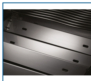
Dual-Level Stainless Steel Sear Plates with Reinforced Bolted Hangers