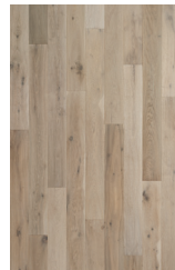
Surrey Hill VM09167SH