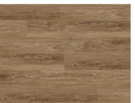
Glad Rags GEMZ50913