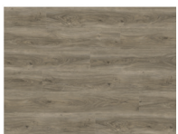
Juice Joint GEMZ50974