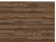
Cat's Pajamas GEMZ50442