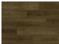
Art Deco GEMZ510