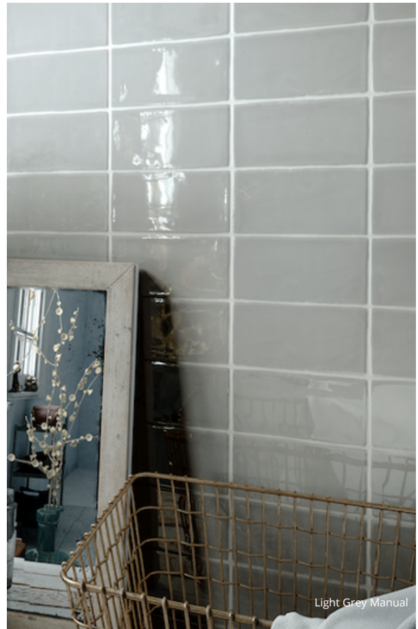
Light Grey Manual