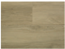
FINEST HOUR EWH-5773