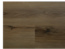
GRAVY TRAIN EWH-7040