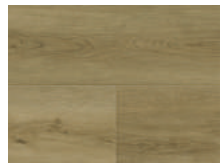
BEST IN SHOW EWH-7112

Wear Layer: Ceramic Bead UV Finish Coating Scratch Shield with SE+ finish .55 mm (22 mil) wear layer