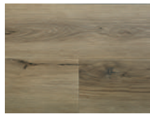
PRIZED POSSESSION EWH-5933