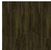
Nova Scotia LI-22001