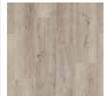
Beaver Creek LI-22004