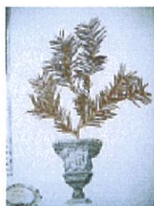
Taxus baccata L. lectotype