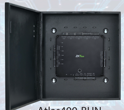
Atlas400-BUN *Also available in 1 or 2 Door options