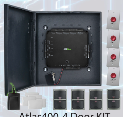
Atlas400-4 Door KI *Also available in 1 or 2 Door options