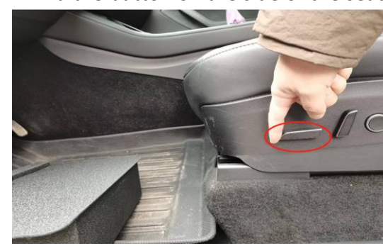
STEP 2 Find the button on the side of the seat.

STEP 3 Hold the button and push the seat back