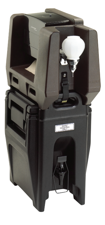
Camtainer with HWATD