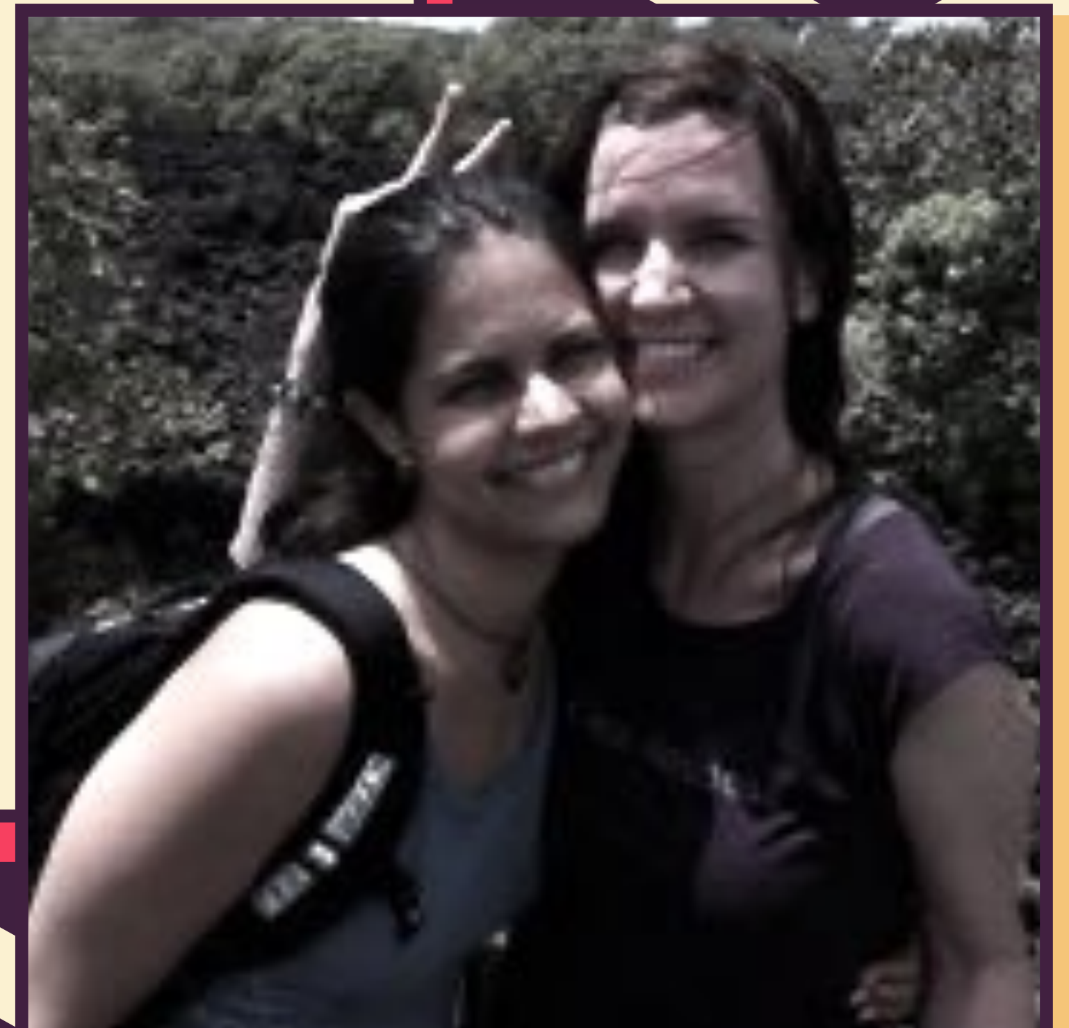
TOP OF A VOLCANO WITH MY BESTIE