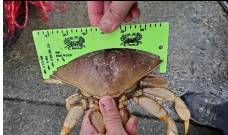
Proper placement of crab gauge measuring Dungeness crab.

Current regulations for the take of Dungeness crab in the recreational fishery are summarized in the table below. Recreational fishers are also required to have a measuring device to ensure all Dungeness crab meet the minimum size limit of 5¾ inches , measured as the shortest distance through the body from edges of shell directly in front and excluding lateral spines (see photo, right).