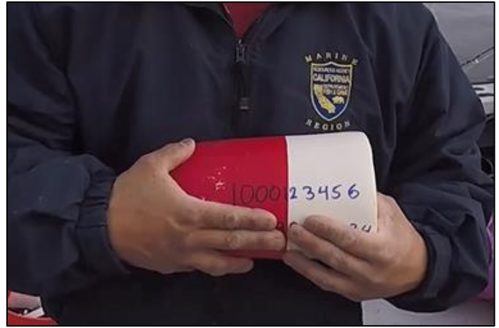
Crab buoy shown with a GO ID number.