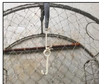
Round-style crab trap with plastic hook attached by the destruct device. The lid will open when the device corrodes or fails.