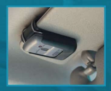
Optional Visor Clip use to mount transmitter in vehicle

GATED COMMUNITIES • APARTMENT COMPLEXES • PARKING • CONDOMINIUM/RESIDENT HALL • MIXED USE • COMMERCIAL • SELF STORAGE • MAXIMUM SECURITY