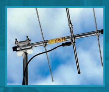
Antenna Options Directional antenna for fringe areas