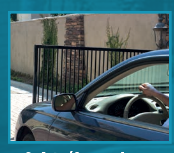
Safety/Convenience range up to 75 feet