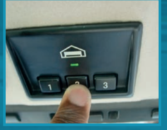
Compatible with Homelink® system