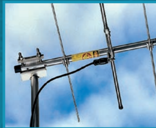
Antenna Options Directional antenna for fringe areas