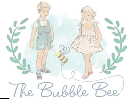
Girls top 1