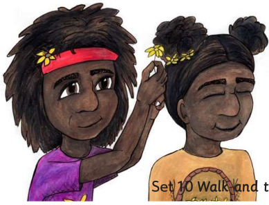
Set 10 Walk and talk

As they walked and talked, they picked flowers growing beside the dirt track.