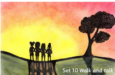
Set 10 Walk and talk

Their shadows grew long as the best friends dawdled back home, arm in arm.