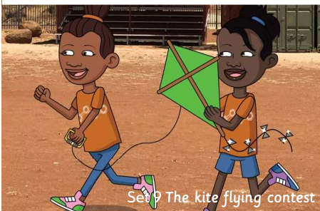
Set 9 The kite flying contest

Jessie has a bright, lime green kite with a long, silver, sparkly tail.