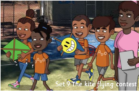
Set 9 The kite flying contest

Today they are going down to the oval to fly the kites.