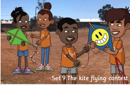
Set 9 The kite flying contest

There are two prizes. One for the kite that flies the longest time.