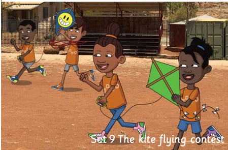
Set 9 The kite flying contest

The other for the kite that flies the highest.