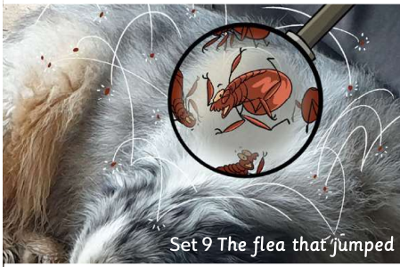
Set 9 The flea that jumped

That day a flea-home was found and the dog doesn't mind him jumping around.