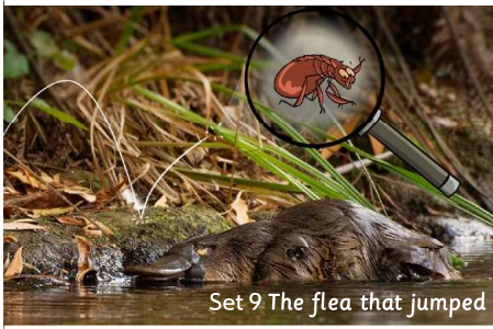
Set 9 The flea that jumped

This is the platypus, all timid and shy, who swam away when the flea jumped by.