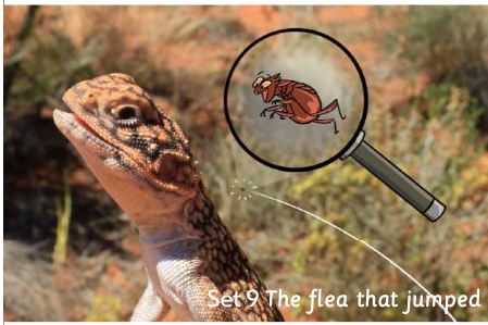
Set 9 The flea that jumped

This lizard got a big fright. The flea jumped right on him and gave him a bite!