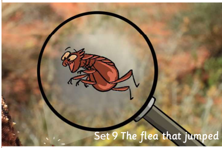
Set 9 The flea that jumped