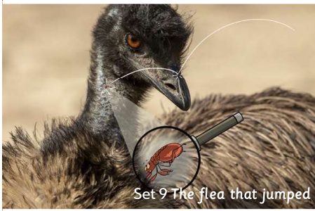
Set 9 The flea that jumped

This is the emu with a very sharp beak. She snapped and made him feel weak.