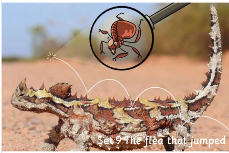
Set 9 The flea that jumped

This thorny devil stayed very still, as the crazy flea jumped, thinking she was a hill.