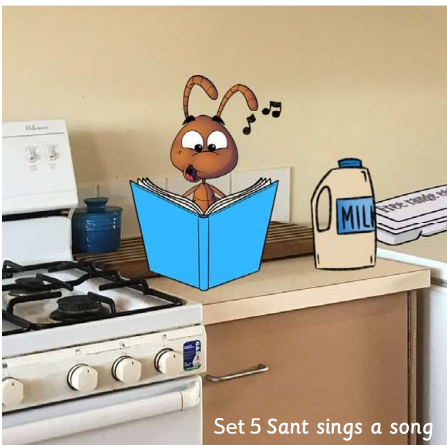
Set 5 Sant sings a song