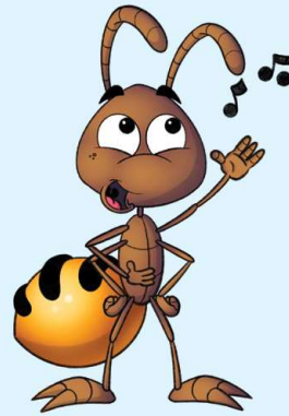
Set 5 Sant sings a song