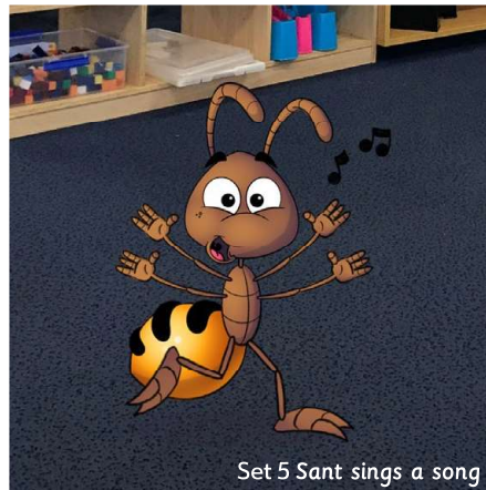
Set 5 Sant sings a song