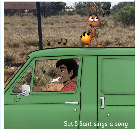
Set 5 Sant sings a song