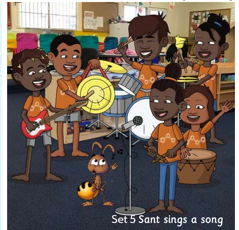
Set 5 Sant sings a song