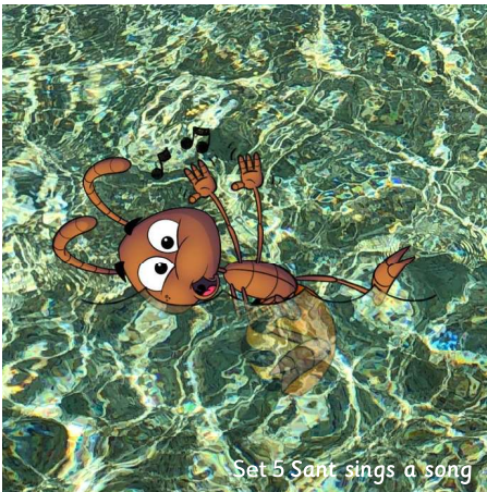
Set 5 Sant sings a song