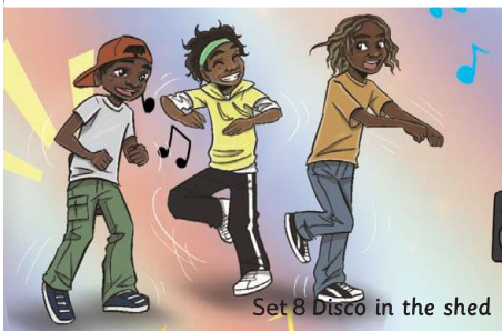
Set 8 Disco in the shed

Wait for the big finish! Goanna – running man!