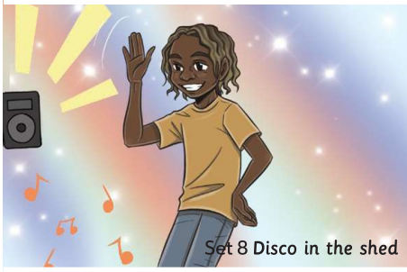
Set 8 Disco in the shed