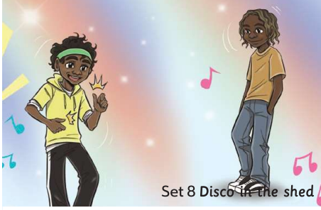
Set 8 Disco in the shed

Eddy stands in the corner, nodding to the music. But then his song comes on.