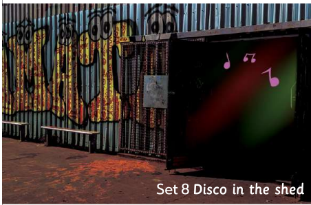
Set 8 Disco in the shed

When the sun sets, we set up the music in the shed for the disco.