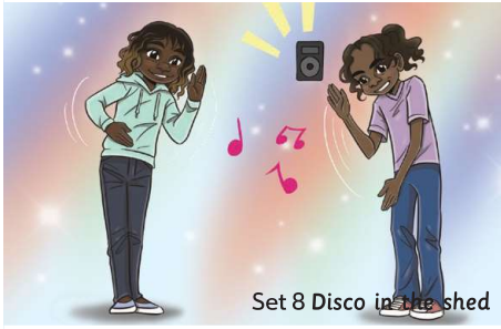
Set 8 Disco in the shed

Jenny and I like to do the robot with stiff arms and legs.